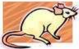
A MOUSE (pl.:MICE)