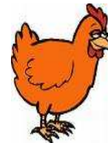
A HEN / A CHICKEN